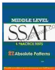
ssat middle level

The SSAT Middle Level covers a wide range of topics, including: