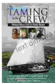
Image alt: Book cover of "The Taming of the Crew" with a group of people working together in a collaborative environment.

Unlock the secrets to effective team management and unleash the full potential of your team. Free Download your copy now and embark on the journey to becoming a successful leader.