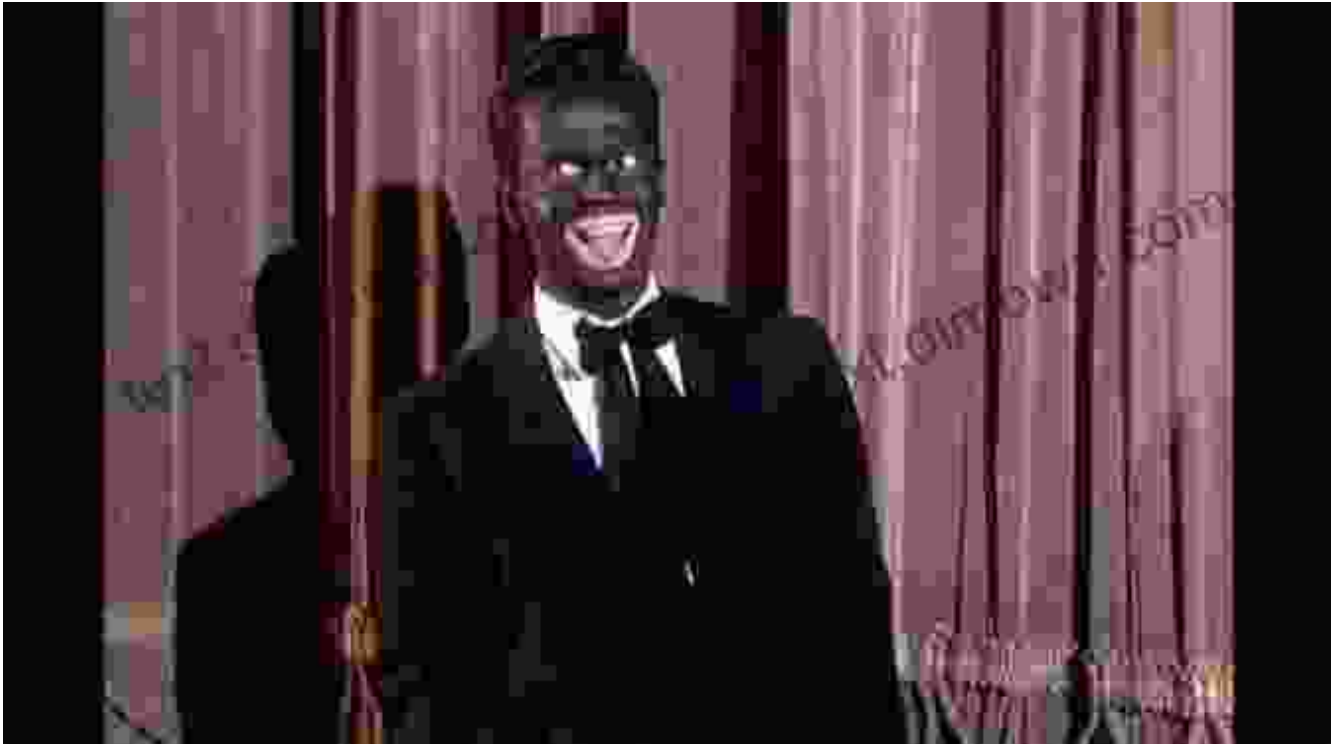
Larry Parks as Al Jolson in "The Jolson Story."

Parks reprised his role as Jolson in two sequels, further solidifying his association with the iconic performer. However, this typecasting also limited his opportunities in other roles, leading to a persistent frustration.