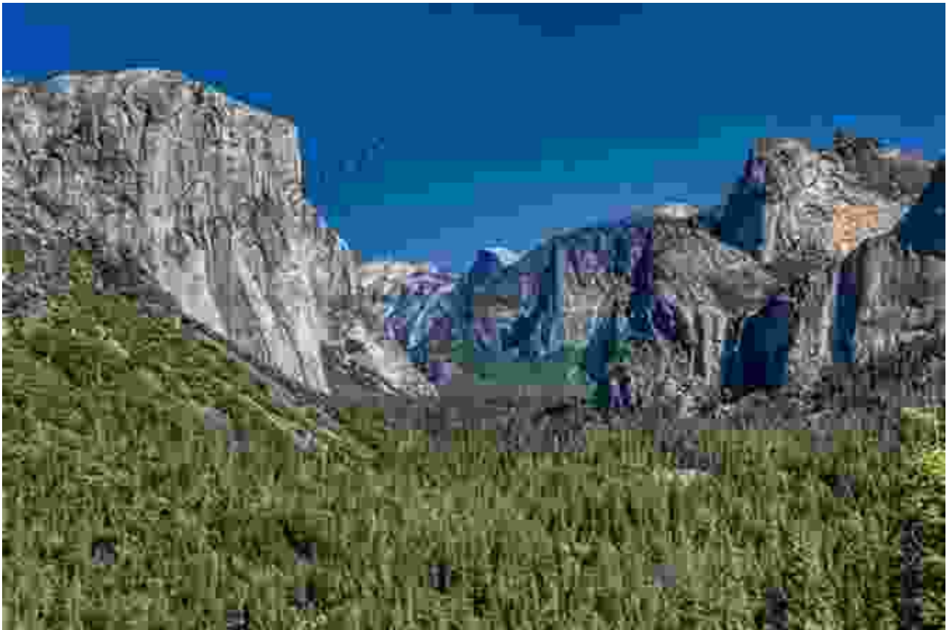
Sequoia National Park: Home to the Ancient Giants