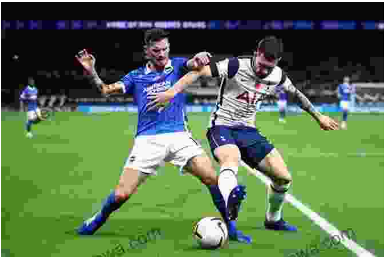
Latchford Albion play against Tottenham Hotspur in the fifth round of the FA Cup

Their dream run reached its peak in the fifth round, where they were drawn against First Division giants Tottenham Hotspur. The match was played at Goodison Park, home of Everton, and despite a valiant effort, Latchford Albion eventually succumbed to a 2-0 defeat.